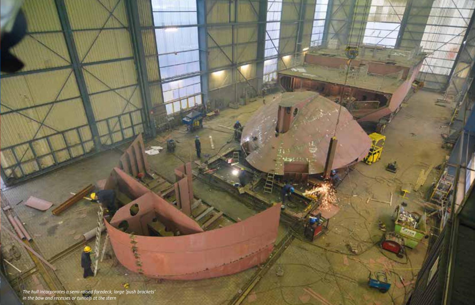
The hull incorporates a semi-raised foredeck, large 'push brackets' in the bow and recesses or tunnels at the stern

Large stocks of shipbuilding steel Specialist cutting and forming skills In-house coating Just-in-time delivery Supplier of complete shipbuilding kits