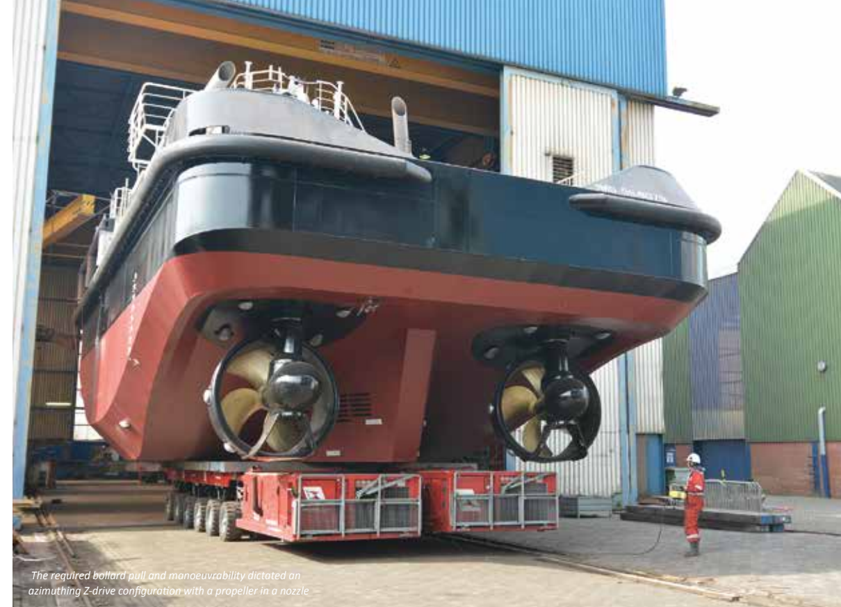
The required bollard pull and manoeuvrability dictated an azimuthing Z-drive configuration with a propeller in a nozzle

OLTHOF WISHES THE CREW OF THE NEW CASPIAN OFFSHORE CONSTRUCTION TUGBOATS FAIR WINDS!