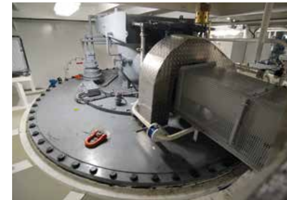
The main engines directly drive two rudder propellers

www.droste-elektro.nl • Phone +31 (0)316 541 759