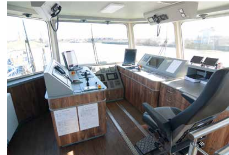
The wheelhouse is equipped with a single central control position, with all controls and instruments to hand

Foxhol facilities. At this location Alewijnse Marine supported Droste Elektro with the complete electrical installation on-board. Interestingly, yard number 485 and 486 are the smallest vessels ever built in the history of Shipyards De Hoop.