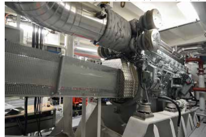
The propulsion system consists of two 1380kW engines directly driving rudder propellers and a hydraulic pump on SB

The entire accommodation is fully heated and air-conditioned, to meet the demanding climate conditions in the environment of Kazakhstan and the Caspian Sea. The wheelhouse, the highest accommodation level, is equipped with a single central control position, with all of the engine and propulsion controls and instruments to hand. The Alphanon navigation and communication package installed complies with the requirements of GMDSS Area 3. In the portside aft corner of the wheelhouse is the