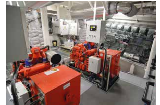
Two 116kW generator assemblies supply electrical power for the vessel

radio console, while the chart table is found to starboard side of centreline, above the (central) stairs to lower decks.